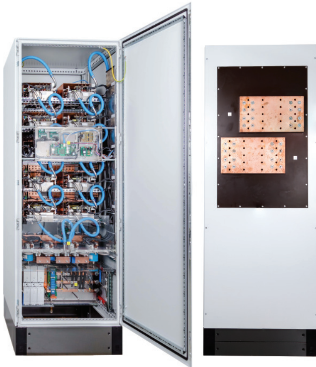
POWER STATION pe5910-W, front view - example

Water cooled DC power supply in switch mode technology, designed for the direct installation at the electroplating tank with minimized floor space.