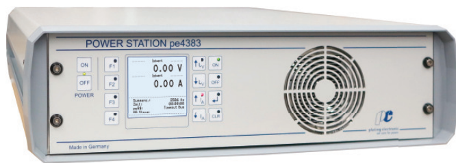
POWER STATION pe4383-ESK, front view

DC power supply in switch mode technology, designed for use in electroplating.