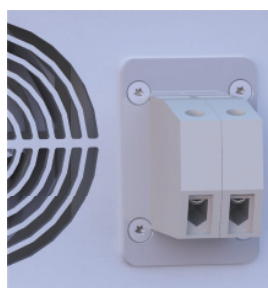
DC high voltage clamps installed in back panel