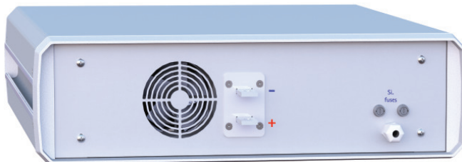
POWER STATION pe4383-ESK, back view