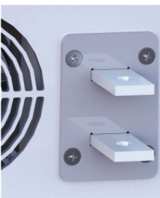
DC tin plated copper bus bars installed in back panel