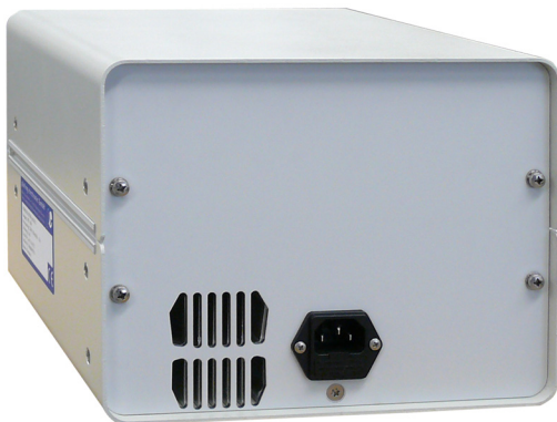
POWER STATION pe1018-2, back view