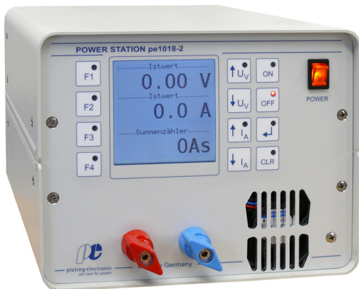
POWER STATION pe1018-2, front view

DC power supply linear controlled, designed for use in electroplating.