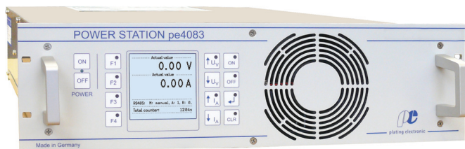
POWER STATION pe4083, front view

DC power supply in switch mode technology, designed for use in electroplating.