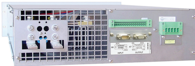
POWER STATION pe4083, back view