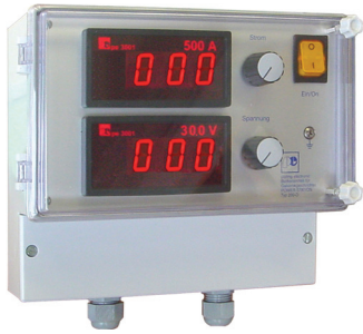
Control unit pe200-D standard, front view

Control unit with digital displays for current and voltage and remote contact ON / OFF. Designed for use in plating environment.