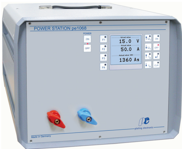
POWER STATION pe1068, front view

DC power supply in switch mode technology, designed for use in electroplating.