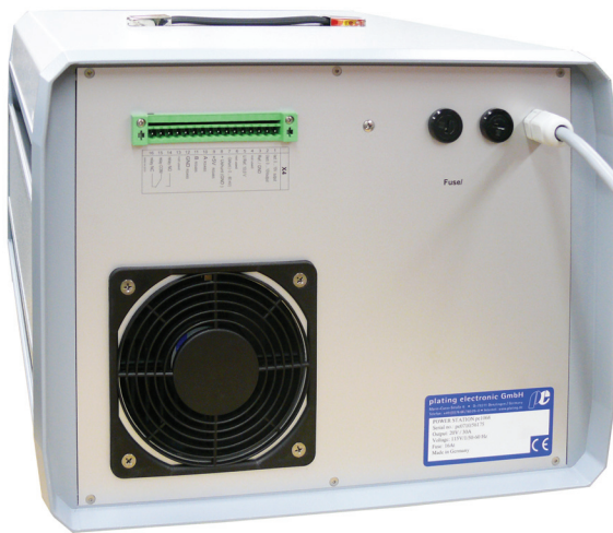
POWER STATION pe1068, back view